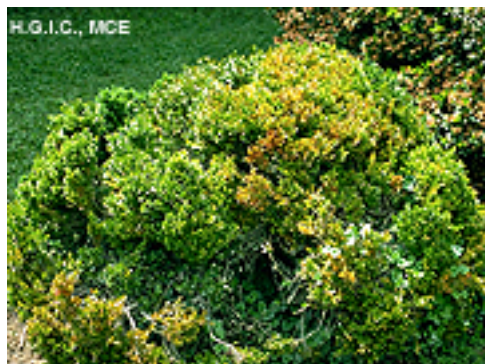
Winter damage on Boxwood

Prevention: Winter damage can be reduced by locating plants