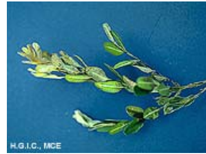
Volutella stem blight

Control: Diseased branches should be pruned out and when the foliage is dry, plants should be thinned to improve air circulation and light penetration. Old fallen leaves and diseased leaves that have accumulated in the crotches of branches in the interior of the plant should be shaken out and removed. Properly timed applications of copper fungicides or lime sulfur applications can be used in severe infections. Sprays will not cure diseased branches. Spray applications should start just before new growth begins in the spring and continue until new growth is completed. Additional sprays may be needed in the fall to protect late summer growth during rainy seasons. Adequate spray cov-