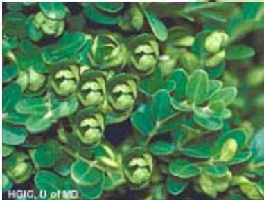
Winter damage on Boxwood