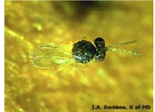
Encarsia (sp.) wasp

Parasitic wasps: a large group of small to large wasps that parasitize a variety of caterpillars, beetle larvae, flies, aphids and other insects. They are slender and black or yellowish to brown. They have a pinched waist and clear wings. Some females may have very long ovipositors or “stingers”, but they can not sting people. The female inserts her eggs into host insects. When the larvae complete their development, they spin cocoons on or near a dead or dying host, and then pupate. Parasitized hornworms are often seen with many white, silken cocoons attached to their bodies. Egg and larval parasites are available commercially.