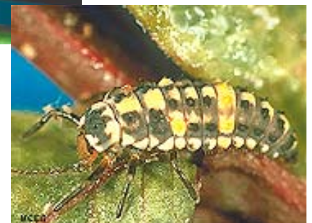
Ladybird Beetle Larva