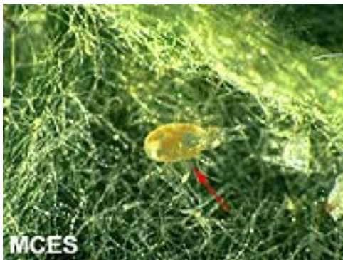
Adult Phytoseid Mite

Predatory mites: widely used as biological control organisms. They are the same size or larger than spider mites and move rapidly. The color may be white, tan, orange or reddish. Predatory mites are commercially available and the supplier can suggest the species and quantity to buy.