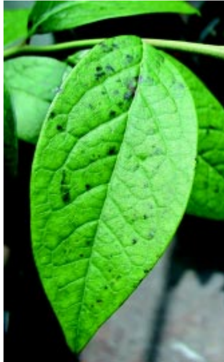
Small lesions on Vaccinium corymbosum 'Weymouth' infected by P. ramorum.

laboratory). Plants infected with P. ramorum should be destroyed because no chemical control measures are currently available. Because P. ramorum is a regulated organism, destruction and disposal protocols will be coordinated by state regulatory officials. If diagnosticians confirm P. ramorum infestation of plants at nurseries or other commercial landscape facilities, an Emergency Action Order from APHIS may be issued. The order may require that P. ramorum -infected plants and all susceptible plants within 2 meters of infected plants be destroyed and that all susceptible plants within 10 meters be held for 90 days until inspected.