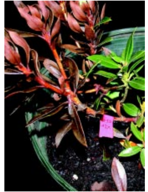
Kalmia latifolia 'Minuet' with severe foliar symptoms from P. ramorum.

laboratory). Plants infected with P. ramorum should be destroyed because no chemical control measures are currently available. Because P. ramorum is a regulated organism, destruction and disposal protocols will be coordinated by state regulatory officials. If diagnosticians confirm P. ramorum infestation of plants at nurseries or other commercial landscape facilities, an Emergency Action Order from APHIS may be issued. The order may require that P. ramorum -infected plants and all susceptible plants within 2 meters of infected plants be destroyed and that all susceptible plants within 10 meters be held for 90 days until inspected.